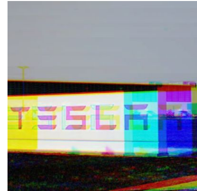
WHITE WORKER, ON MUSLIM TEMP WORKERS AT GIGAFACTORY 2